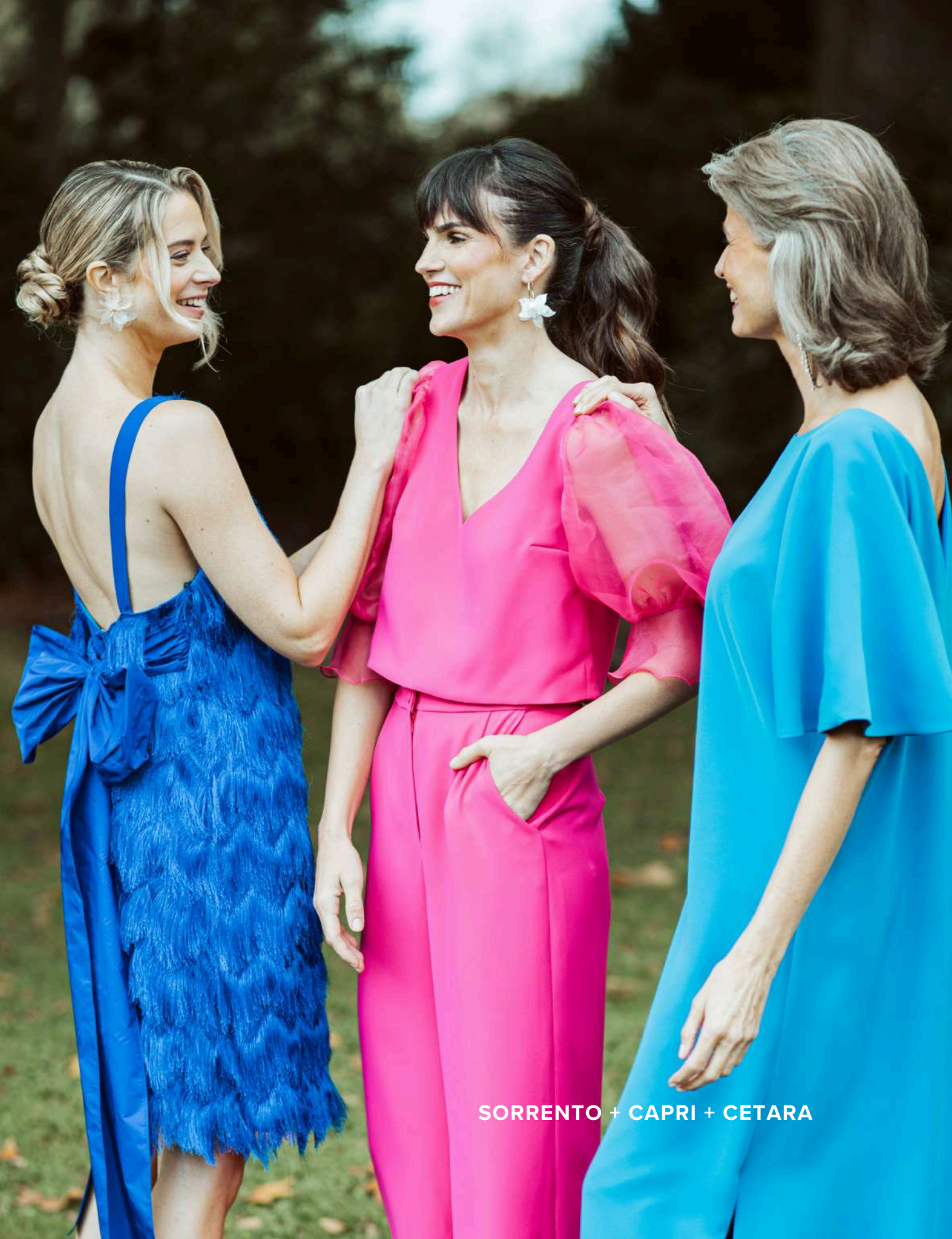
SORRENTO + CAPRI + CETARA