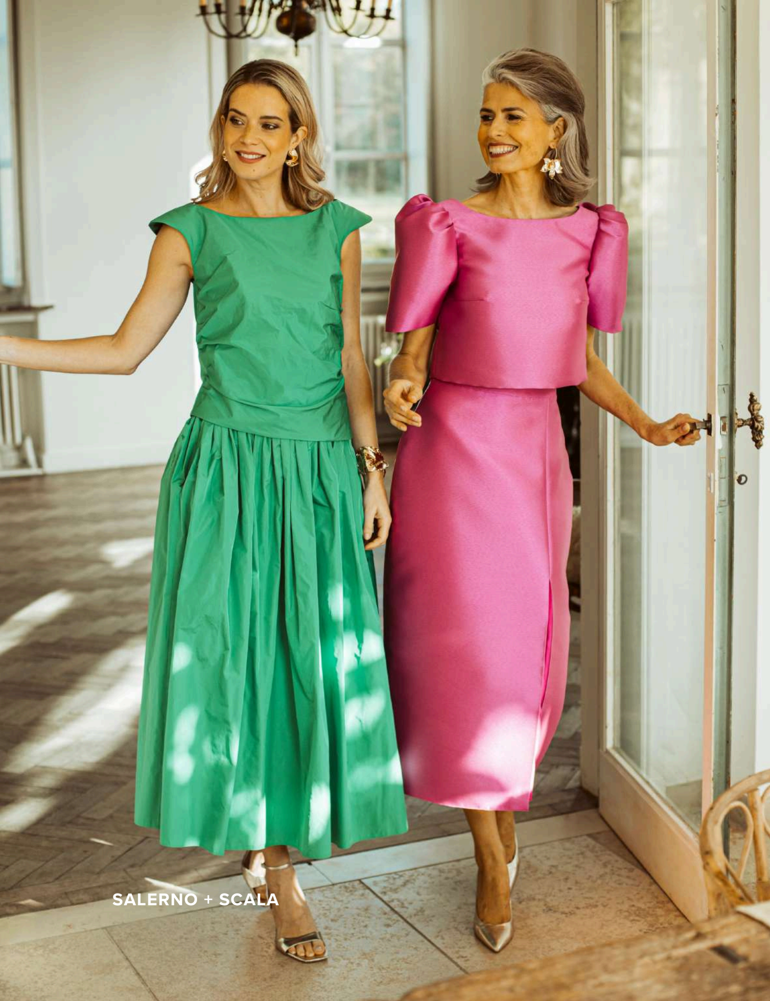
SALERNO + SCALA