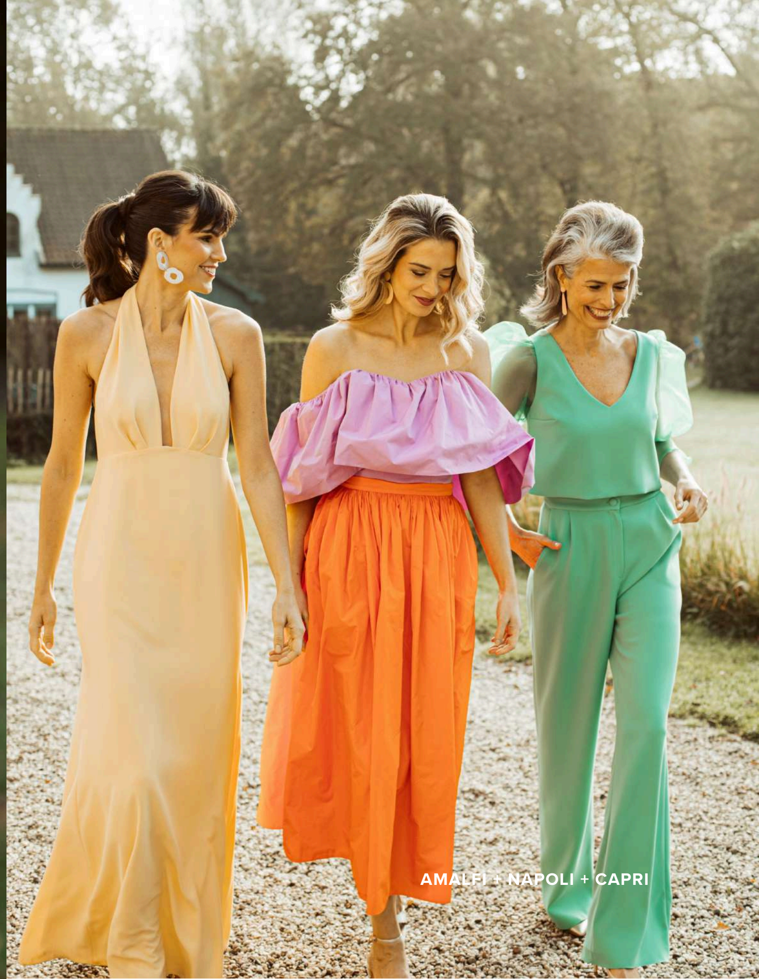
AMALFI + NAPOLI + CAPRI