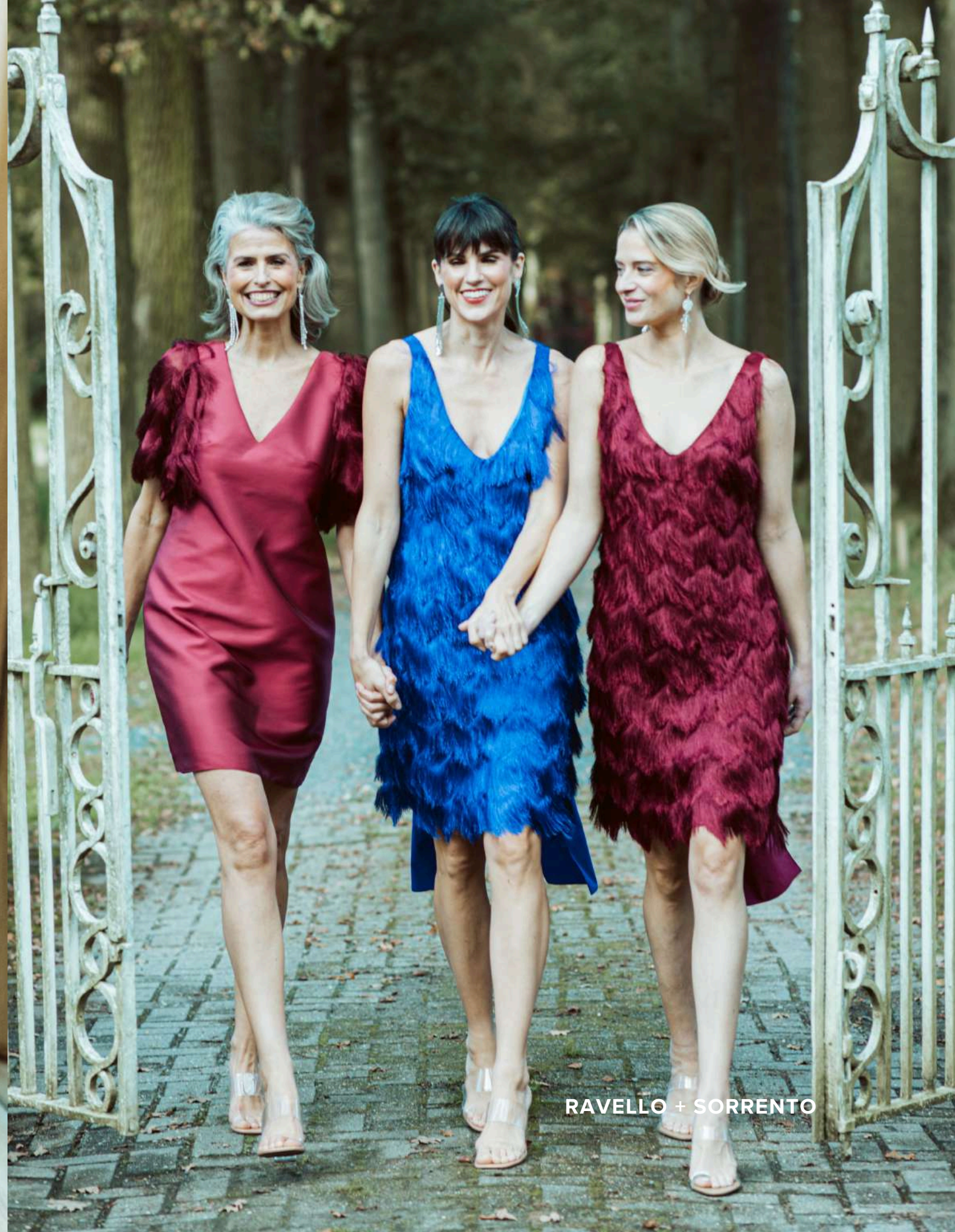
RAVELLO + SORRENTO